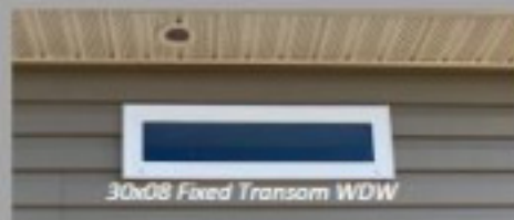
30x08 Fixed Transom WDW