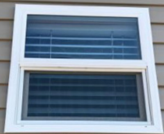
24x24 WDW Only in Clear