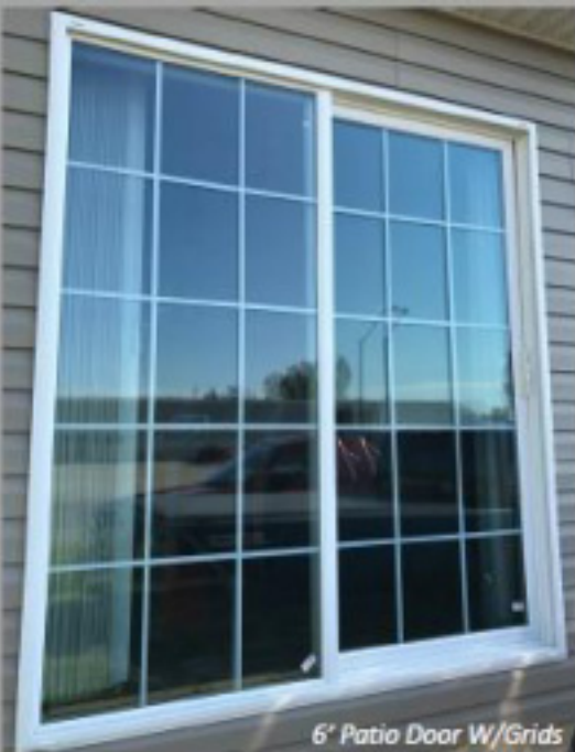
6" Patio Door W/Grids