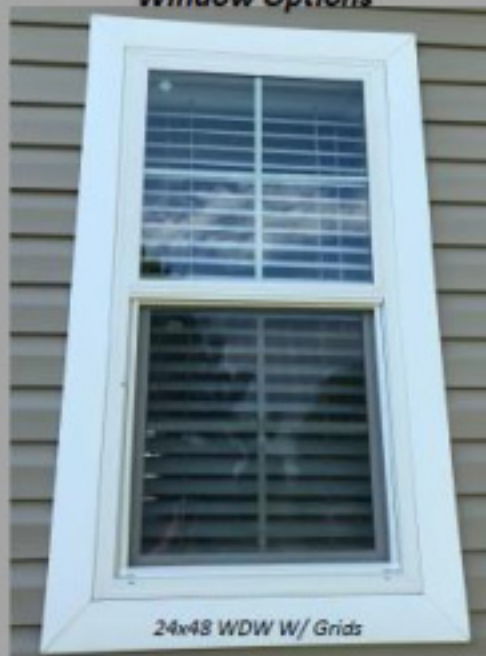
24x48 WDW W/ Grids