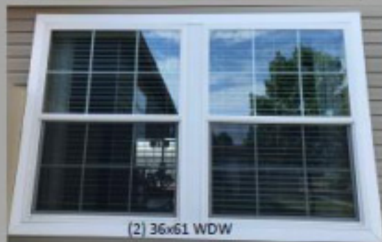
(2) 36x61 WDW