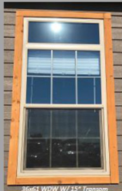
36x61 WDW W/ 15" Transom