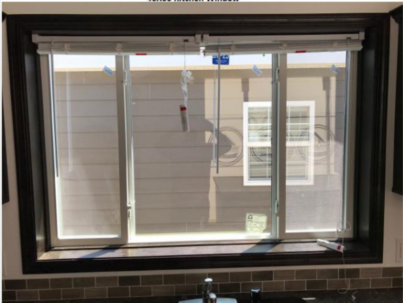
40X60 Kitchen Window